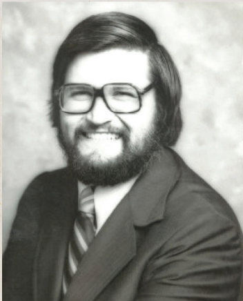
July 28, 1949-November 6, 2005

Chicken Parmigiana CHICKEN BREAST, GRILLED OR FRIED, COVERED WITH ROD'S MARINARA, PARMESAN AND MOZZARELLA CHEESE, WITH A SIDE OF VERMICELLI 18.99